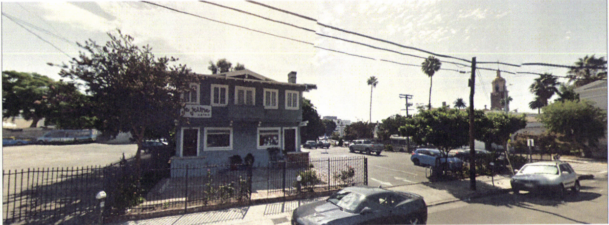
Photograph 7: View of Northeast corner of Selma Avenue and Las Palmas Avenue