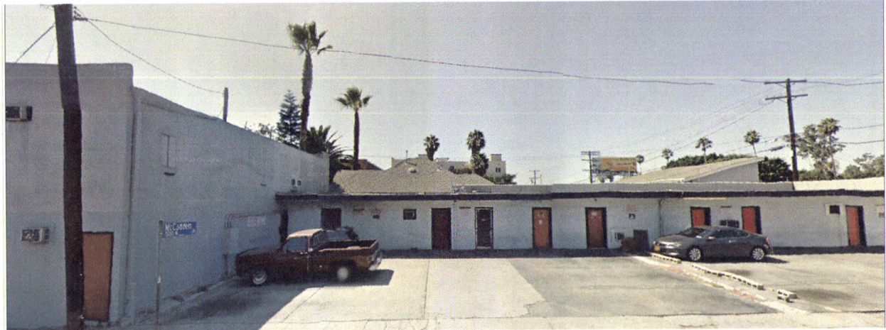
Photograph 13: View of Southern side of Selma Avenue