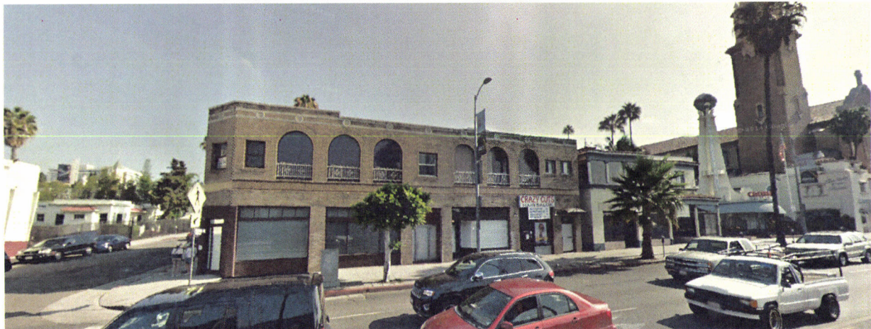
Photograph 2: View of Northeast corner of Sunset Boulevard and Las Palmas Avenue