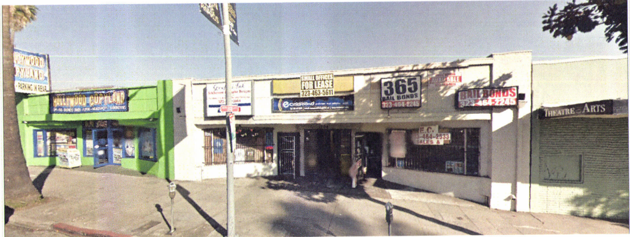
Photograph 16: View of Eastern side of Highland Avenue