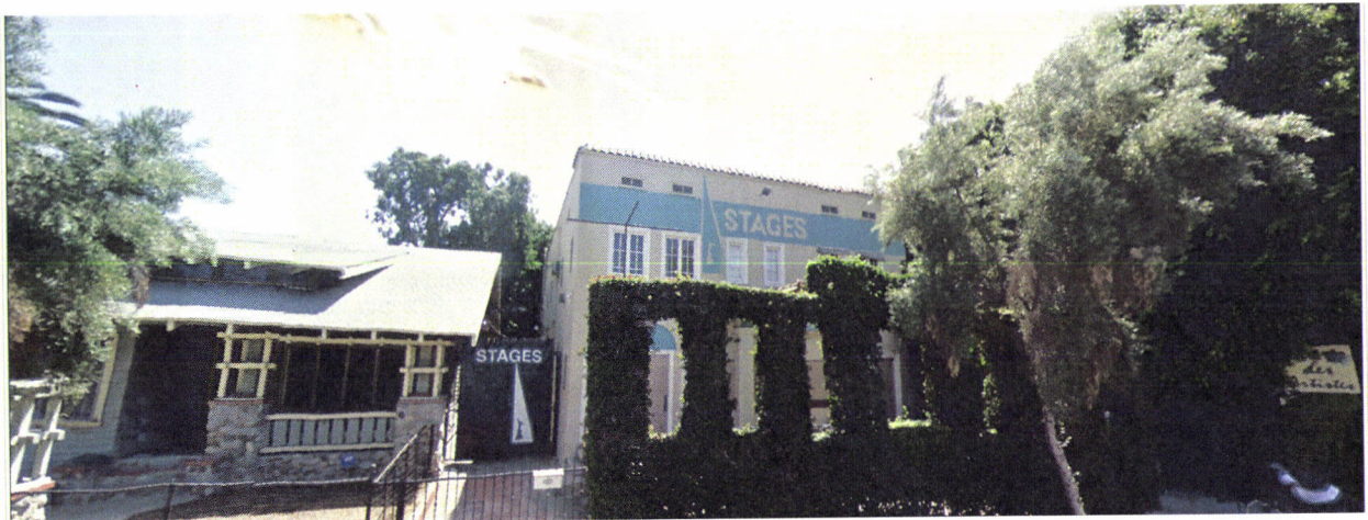
Photograph 17: View of Eastern side of McCadden Place