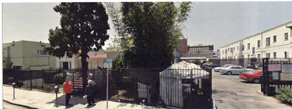
Photograph 9: View of Western side of Las Palmas Avenue