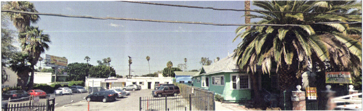
Photograph 19: View of Western side of McCadden Place