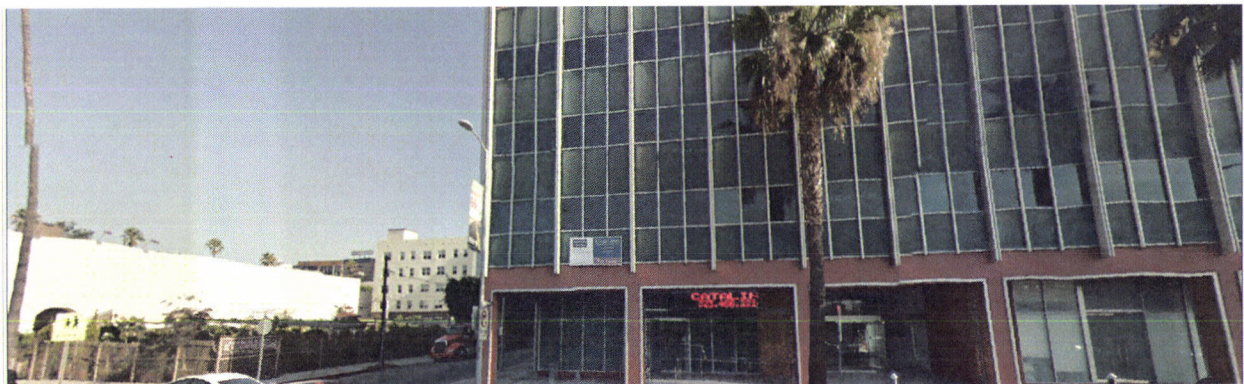
Photograph 23: View of Northeast corner of Sunset Boulevard and McCadden Place