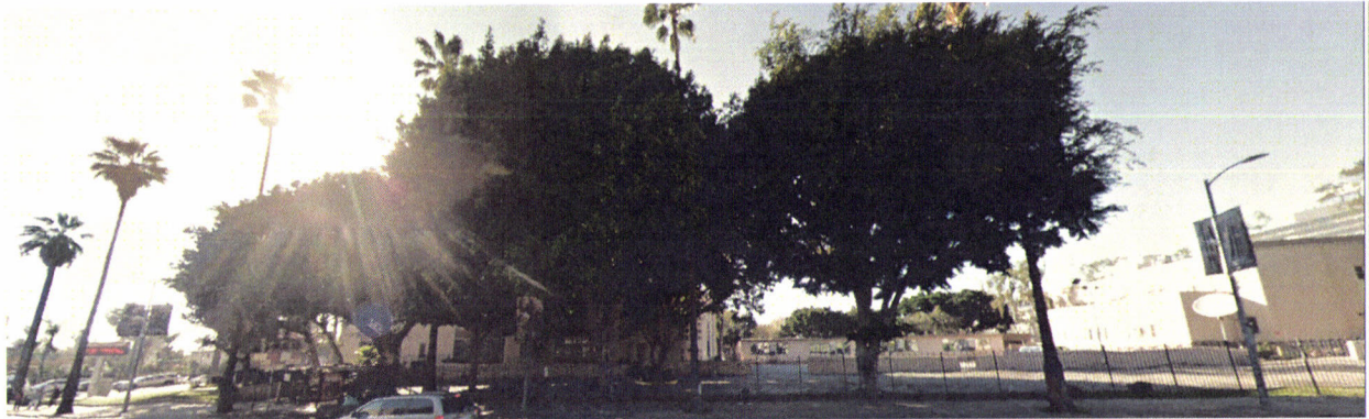
Photograph 25: View of West side of Highland Avenue