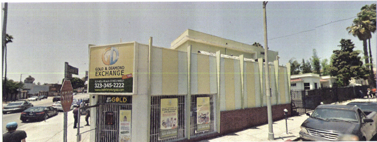
Photograph 8: View of Northwest corner of Sunset Boulevard and Las Palmas Avenue