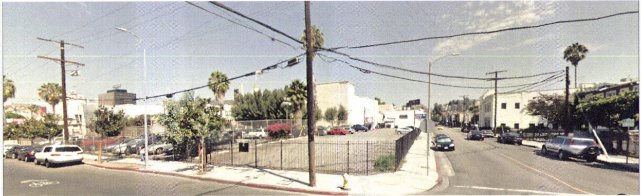
Photograph 28: view of Northwest corner of Selma Avenue and Las Palmas Avenue