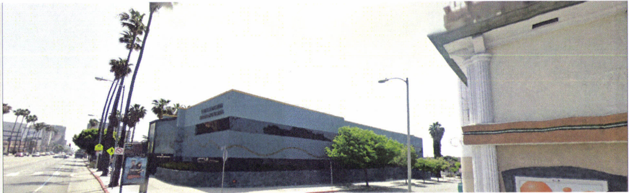
Photograph 22: View of Southeast corner of Sunset Boulevard and Las Palmas Avenue