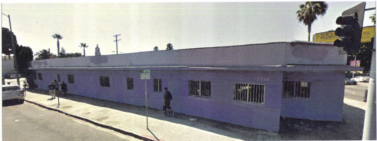
Photograph 14: View of Southeast corner of Selma Avenue and Highland Avenue