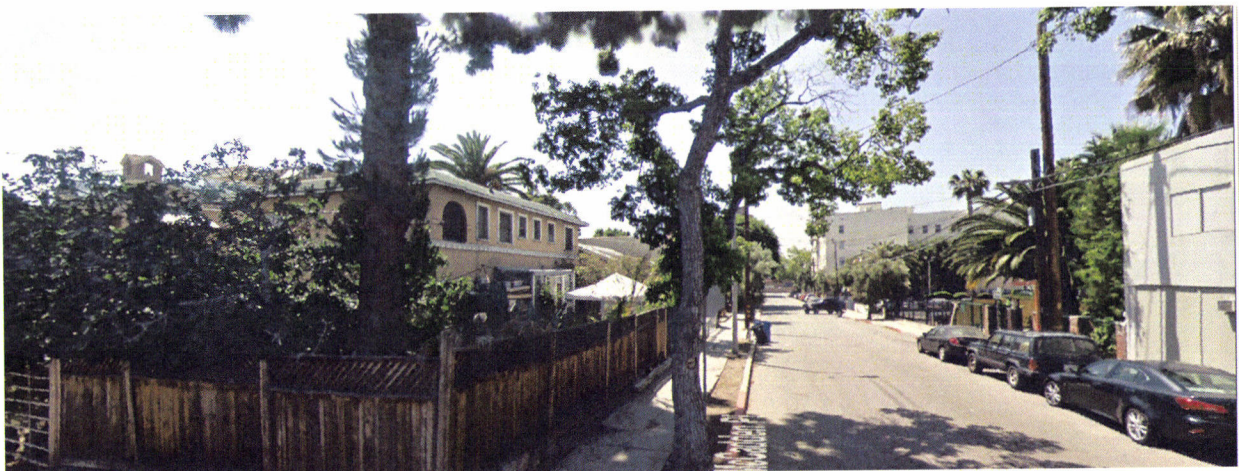
Photograph 18: View of Northeast corner Selma Avenue and McCadden Place