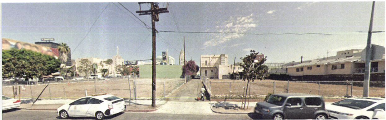
Photograph 26: View of North side of Selma Avenue between Highland Avenue and McCadden Place