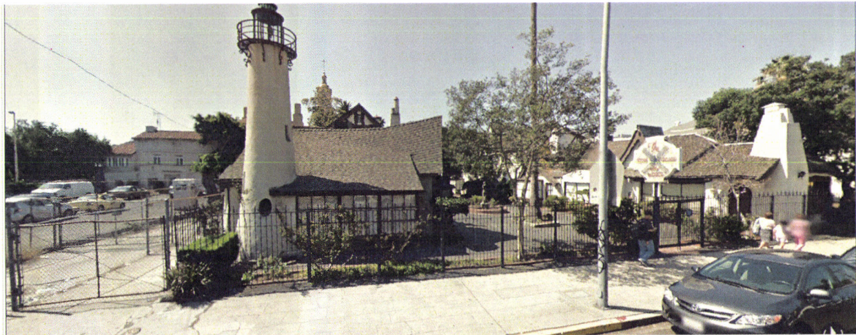
Photograph 5: View of existing Crossroads of the World from Selma Avenue