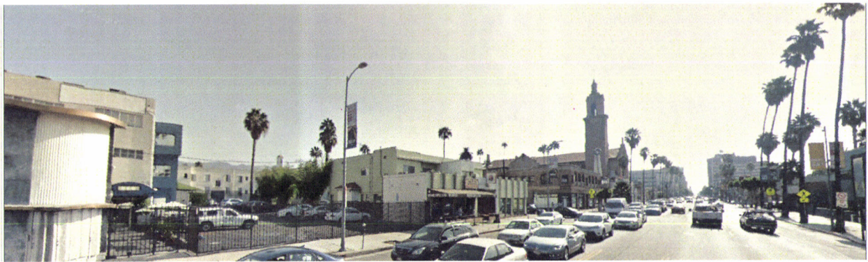
Photograph 20: View of North side of Sunset Boulevard