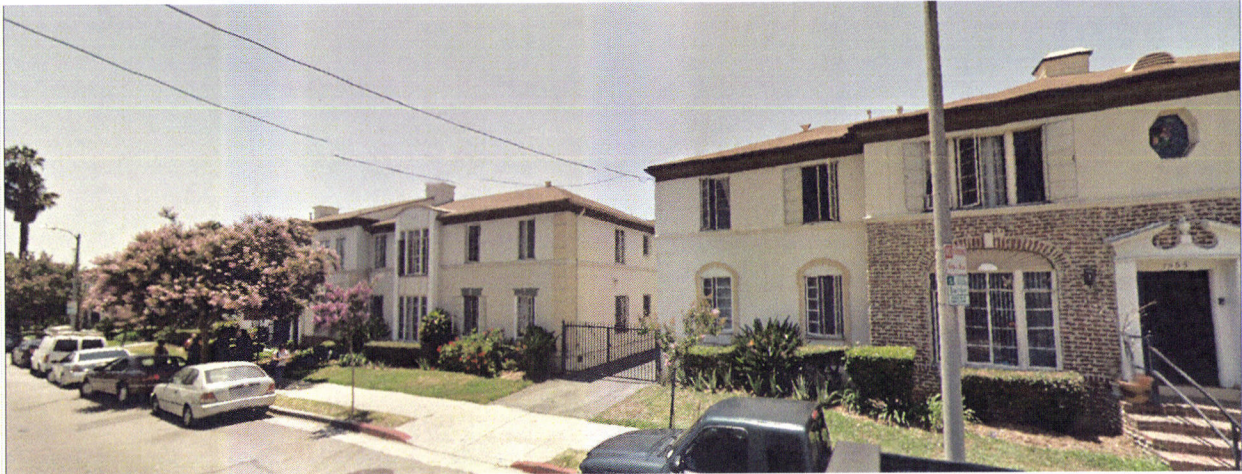
Photograph 10: View of Western side of Las Palmas Avenue