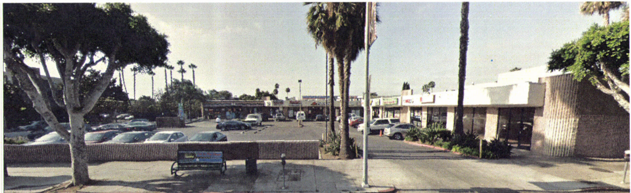
Photograph 21: View of South side of Sunset Boulevard across from Project Site