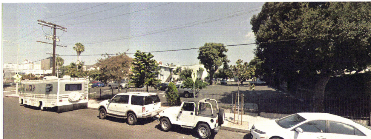
Photograph 6: View of Northeast corner of Selma Avenue and Las Palmas Avenue