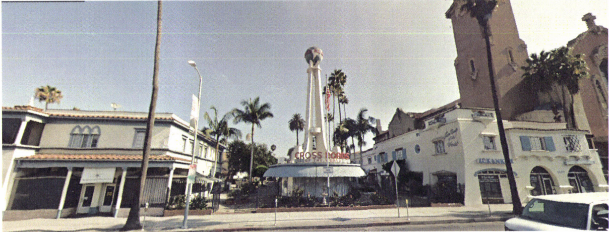
Photograph 1: View of Existing Crossroads of the World from Sunset Boulevard