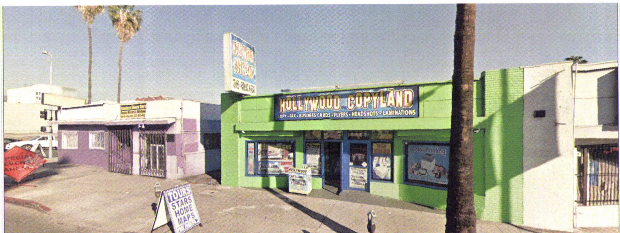
Photograph 15: View of Eastern side of Highland Avenue