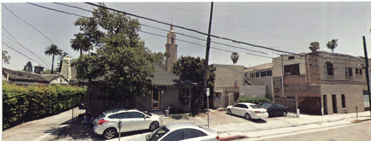
Photograph 3: View of Eastern side of Las Palmas Avenue