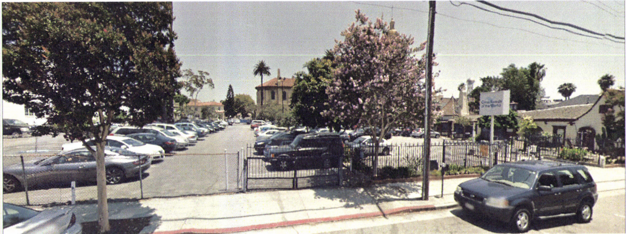
Photograph 4: View of existing Crossroads of the World Parking Lot on Las Palmas Avenue