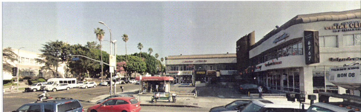
Photograph 24: View of Northeast corner of Sunset Boulevard and Highland Avenue