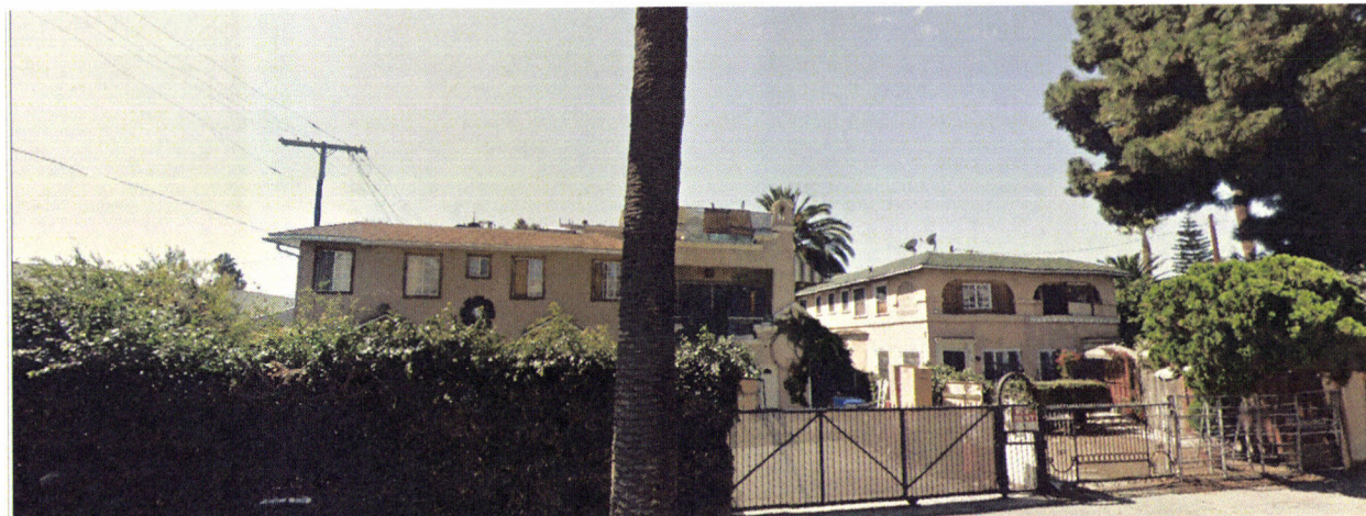
Photograph 12: View of Southern side of Selma Avenue near McCadden Place