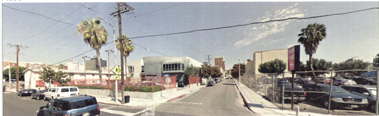
Photograph 27: View of North side of Selma Avenue at McCadden Place