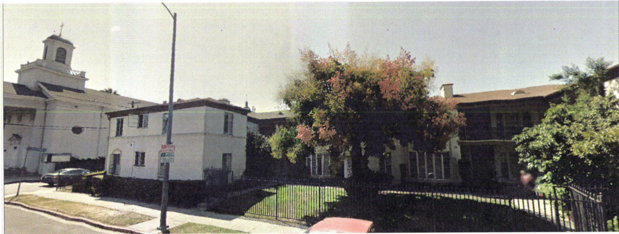
Photograph 11: View of Southeast corner of Selma Avenue and Las Palmas Avenue